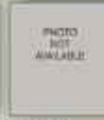
Photo Not Available Councilor